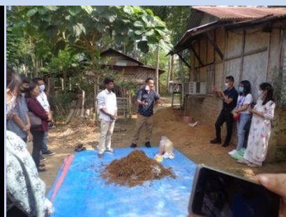
Participants at Mushroom Farm witnessing demonstration.