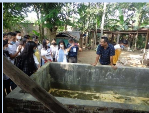
Participants at demonstration site