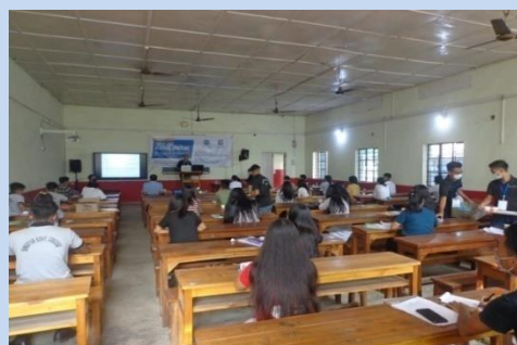
Section of the Participants in the Conclave